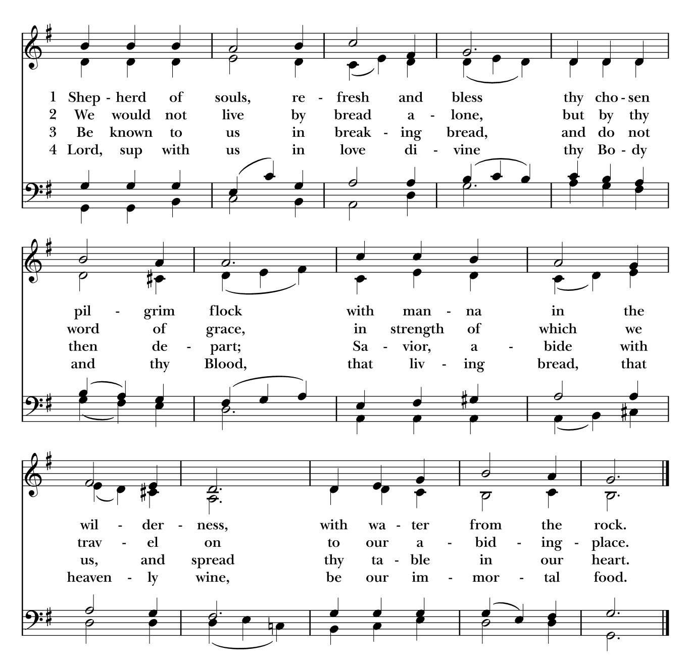
Offertory Hymn 343